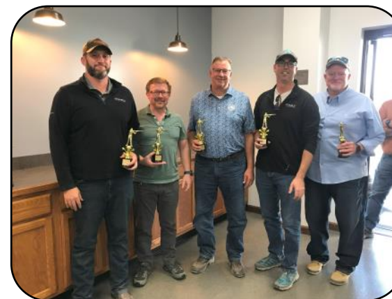
Plan to shoot with us next year. Put Friday, October 11, 2024 on your calendar.