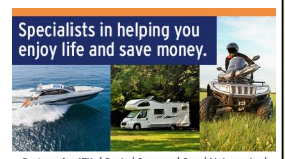
For loans for ATVs | Boats | Campers | Cars | Motorcycles | RVs | Trucks | SUVs in Delaware County, we're here for you!